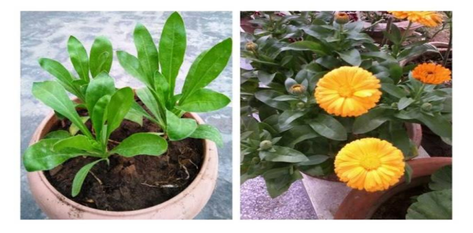
Figure 1 Growing and mature plant of Herb Calendula officinalis Linn. Containing flowers.

and to treat conjunctivitis, diaper rashes, hemorrhoids, stomatitis and inflammatory conditions of mucous membranes (15). Dried petals of the flower are used as an alternative of saffron in spice trade. Because of its golden color, calendula leaves are also used in ointments to impart color (16). Dried flowers are also used in sudorific, blood refiner, hypoglycemic and various insect repellent preparations (17). Flowers of the plant have a