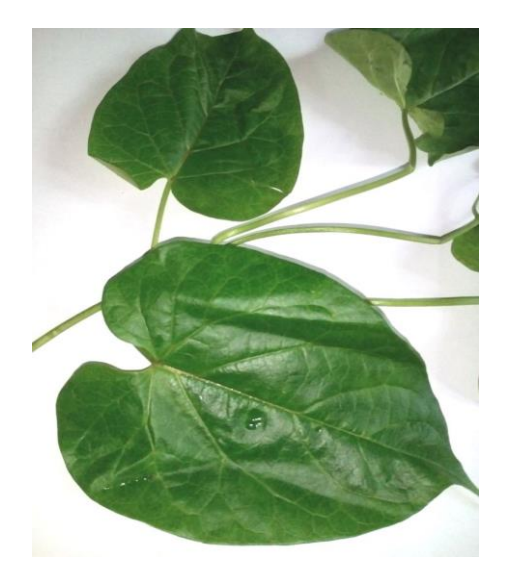
Figure 1 Leaf of Gongronema latifolium collected from a stem on December 12, 2018